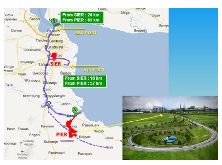
Figure 1. Pasuruan Industrial Estate Rembang Map [16]